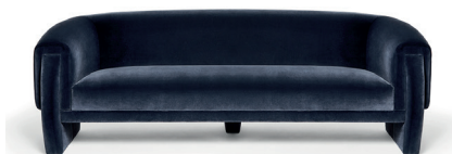
2019 - LUKE | SOFA INTERNATIONAL DESIGN & ARCHITECTURE AWARDS