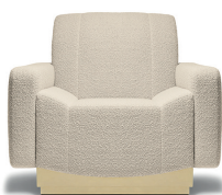
2019 - GRAN TORINO | ARMCHAIR GOOD DESIGN AWARDS