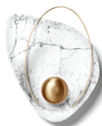
2017 - PEARL | WALL LAMP GOLD AND SILVER EUROPEAN PRODUCT DESIGN AWARDS