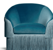
2018 - FRINGES | ARMCHAIR EUROPEAN PRODUCT DESIGN AWARDS